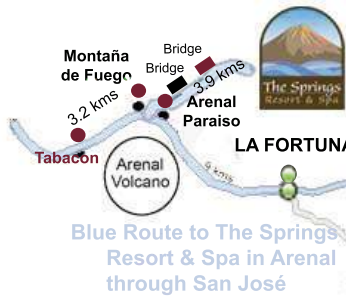
Blue Route to The Springs Resort & Spa in Arenal through San José

Directions to Peace Lodge at La Paz Waterfall Gardens Telephone: C.R. 506-2482-2720 www.waterfallgardens.com